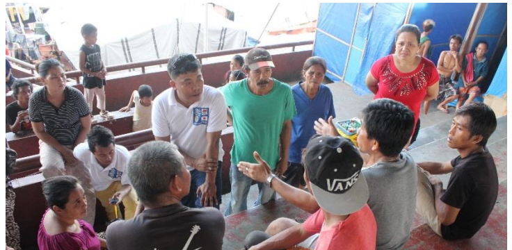
IDPs, who are living in bedkits with privacy partitions located on the Grandstand bleachers, were consulted about their concerns on their present living condition.