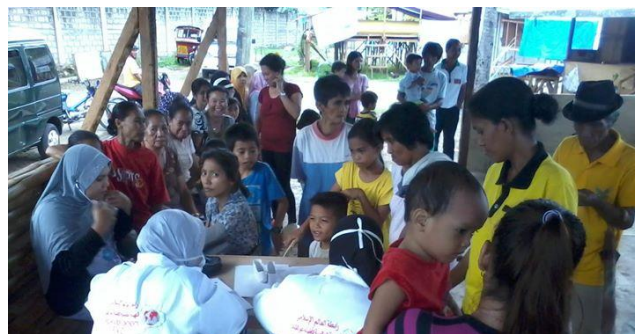
Physicians Across Continents (PAC) conducting free medical services to IDPs in PTSI Transitory Site.