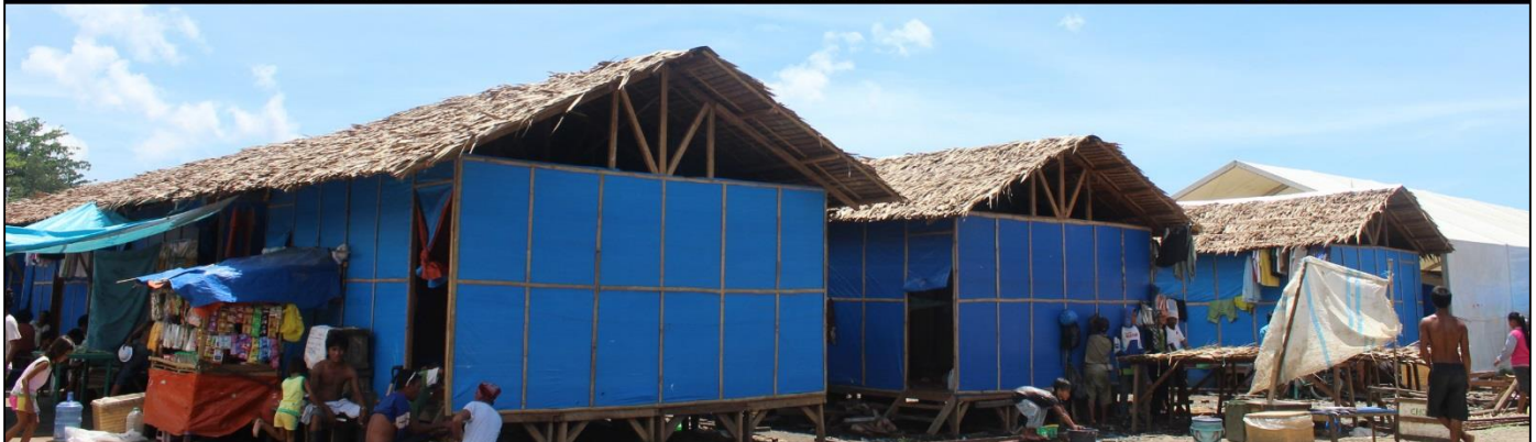
In Grandstand, the construction of Modified Shelters, with elevated flooring and nipa roofing, is almost done. Out of the target construction of 452 rooms, 292 rooms are already completed and being occupied by IDP families.