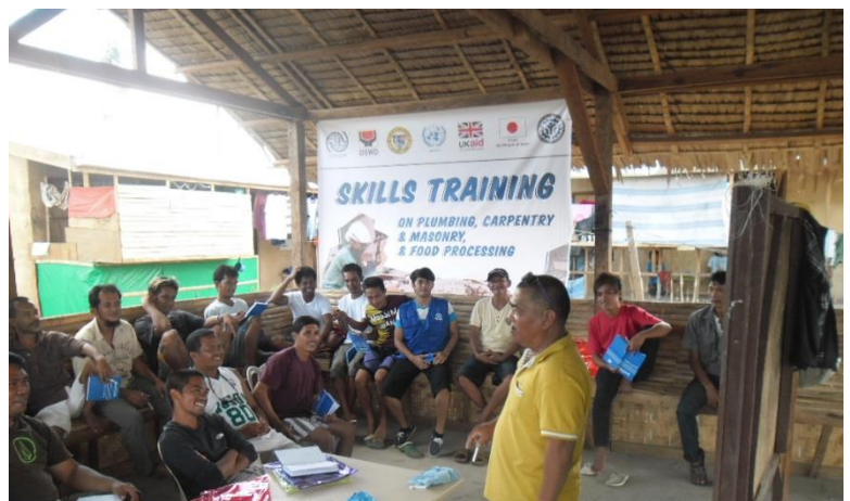
IDPs in Tulungatung TS actively participated during the orientation of the 21-day Skills Training Workshop of CCCM Cluster and TESDA.