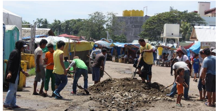
Gravel filling in Grandstand as provided by the Zamboanga City Government and IOM.