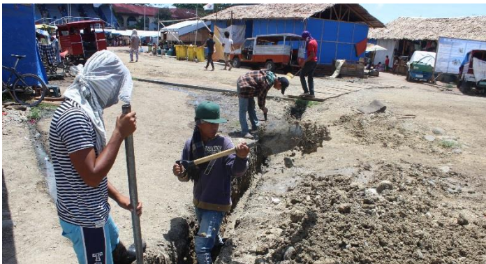
Reinforcement of waterway exit in Grandstand to address the flood problem during rain.