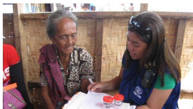
Nurse Health Communicators that were deployed in Grandstand and in Cawa-cawa ECs have already referred a total of 185 health cases.