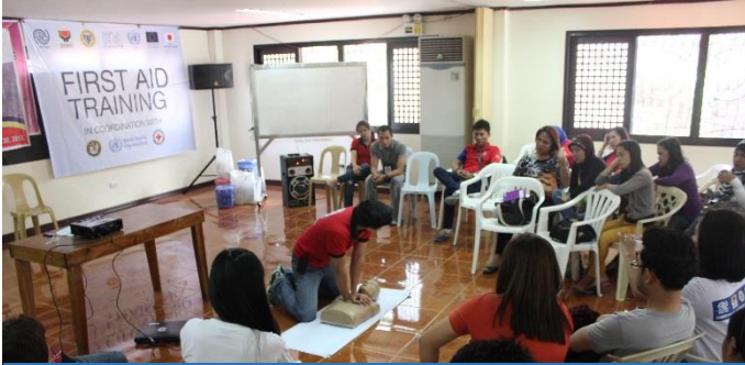
Camp Managers and IDP leaders participated during the two separate 2-day First Aid Training conducted by Red Cross and facilitated by the CCCM Cluster.