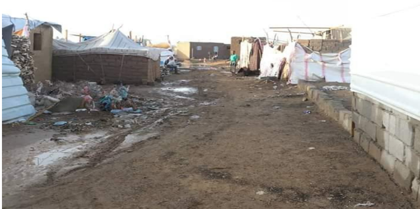
House wall in Al Jufaina IDP Camp destroyed from heavy rain.