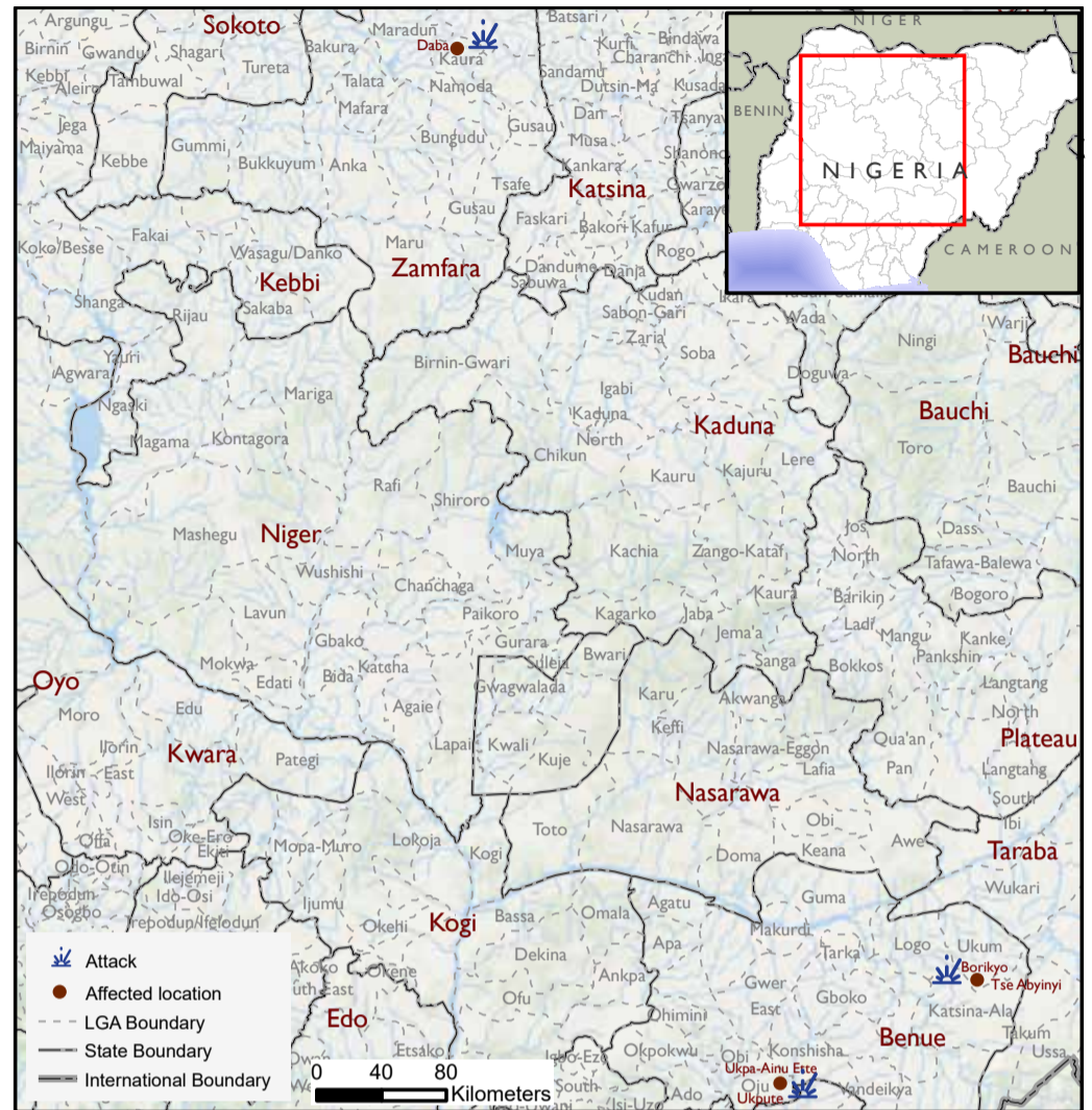
Map 1. Showing locations affected.

Nigeria's north-central and north-west zones are afflicted with a multi-dimensional crisis. Long-standing tensions between ethnic and religious groups often result in attacks and banditry or hirabah. These attacks involve kidnapping and grand larceny along major highways by criminal groups. During the past years, the crisis accelerated and has resulted in widespread displacement across the north-central and north-west regions.