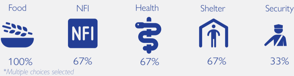
Fig. 2. Most needed assistance