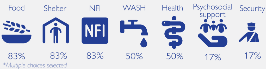
Fig. 2. Most needed assistance