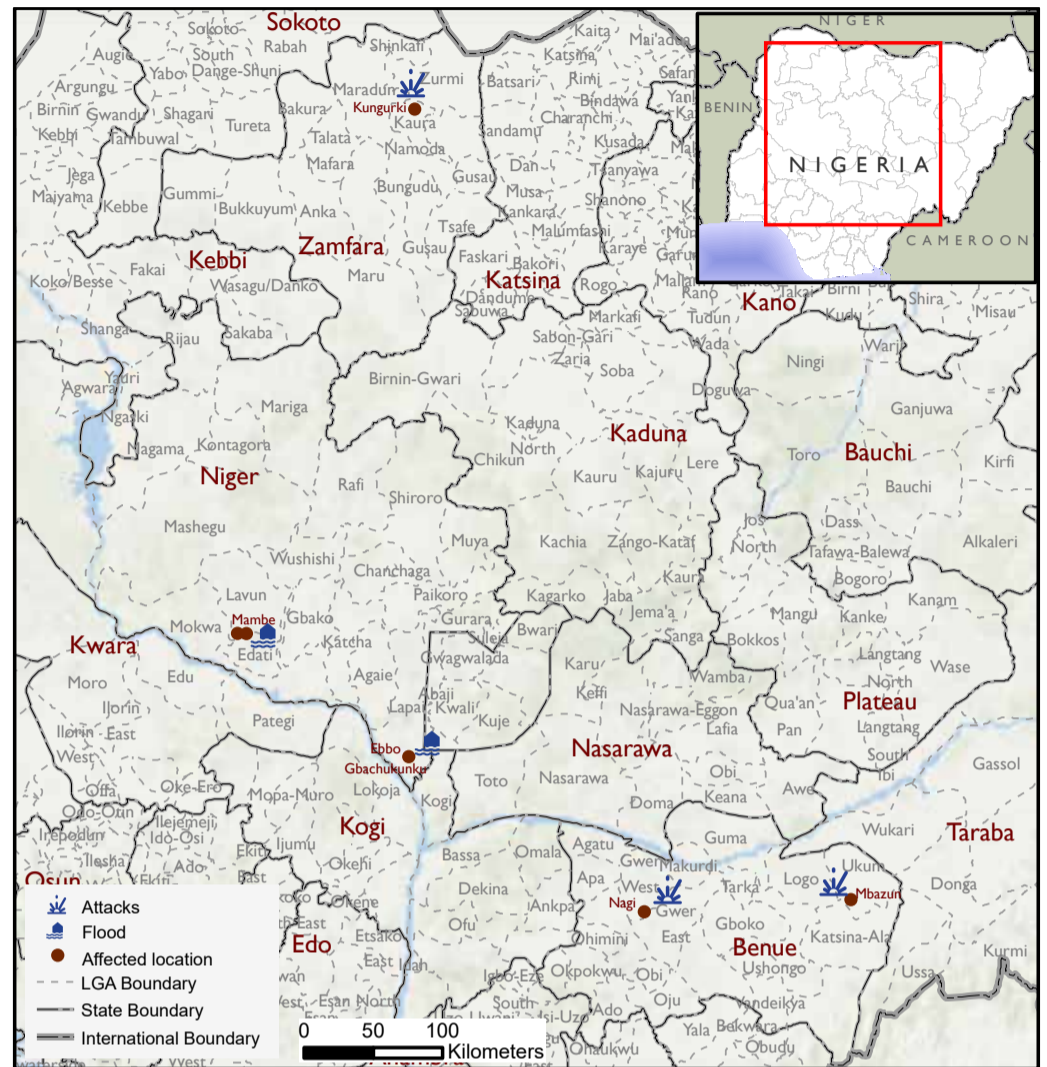
Map 1. Showing locations affected.

Nigeria's north-central and north-west zones are afflicted with a multi-dimensional crisis. Long-standing tensions between ethnic and religious groups often result in attacks and banditry or hirabah. These attacks involve kidnapping and grand larceny along major highways by criminal groups. During the past years, the crisis accelerated and has resulted in widespread displacement across the north-central and north-west regions.