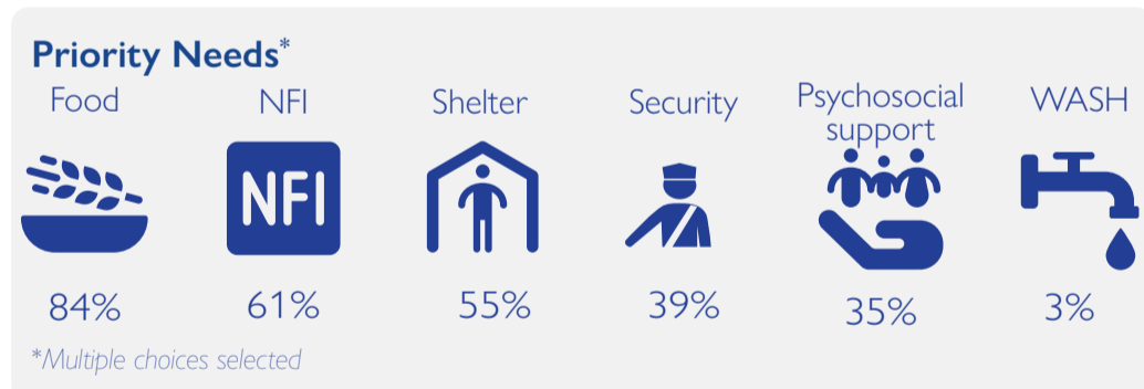
Fig. 2. Most needed assistance

This map is for illustration purposes only. The boundaries and names shown, and the designations used on this map do not imply official endorsement or acceptance by the International Organization for Migration.