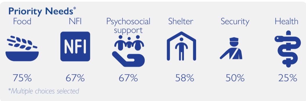
Fig. 2. Most needed assistance