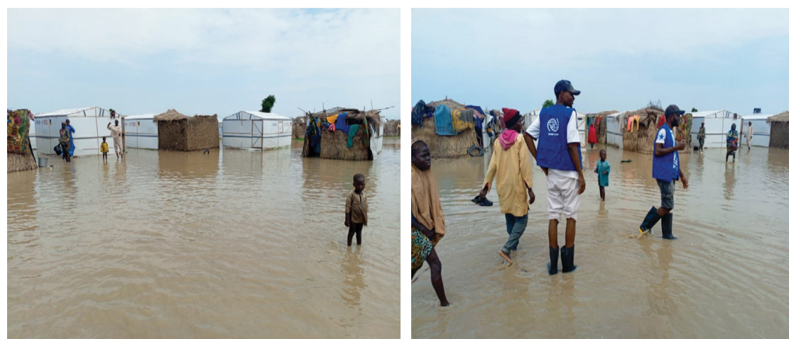
Picture showing damaged shelters after the heavy rainfall