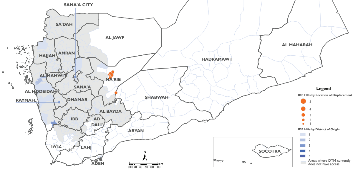
Disclaimer: This map is for illustration purposes only. Names and boundaries on this map do not imply official endorsement or acceptance by IOM.