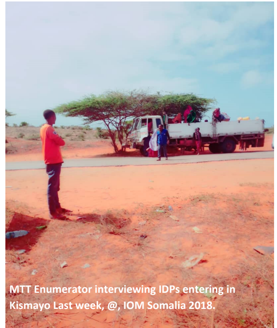
MTT Enumerator interviewing IDPs entering in Kismayo Last week, @, IOM Somalia 2018.