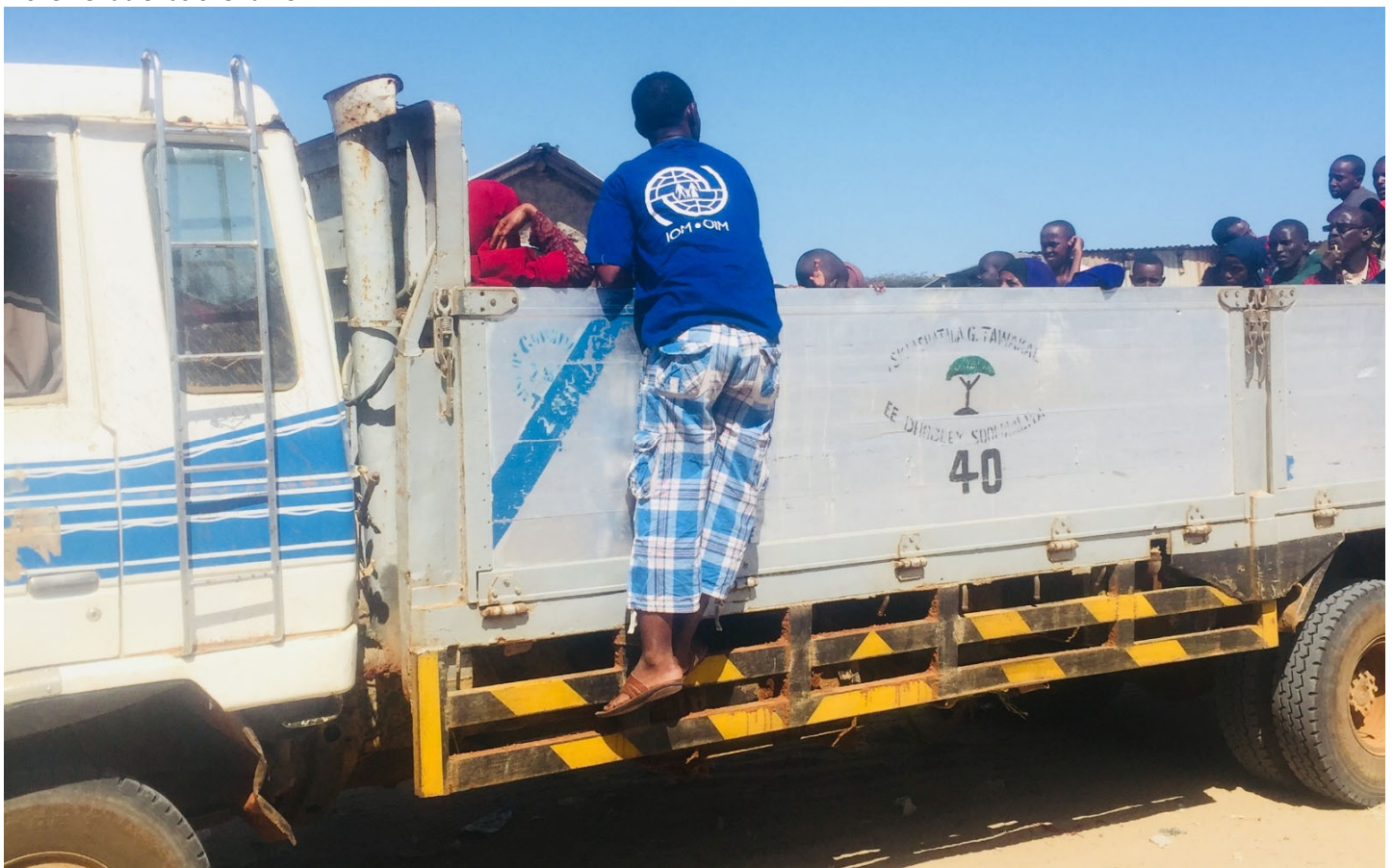
MTT Enumerator interviewing IDPs exiting in Kismayo @, IOM Somalia 2018.

MTT aims to complement existing information management products on displacements and movements in Kismayo, by providing site level specific data on population movements on a regular basis, to assist agencies operating in sites and settlements with key information on: demographics of movement, area of origin, area of return/onward movement, reasons for movement and movement trends over time.