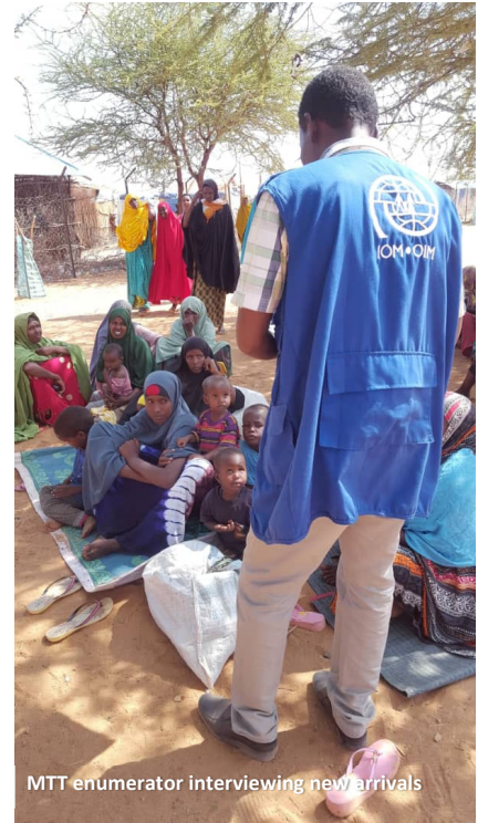
MTT enumerator interviewing new arrivals