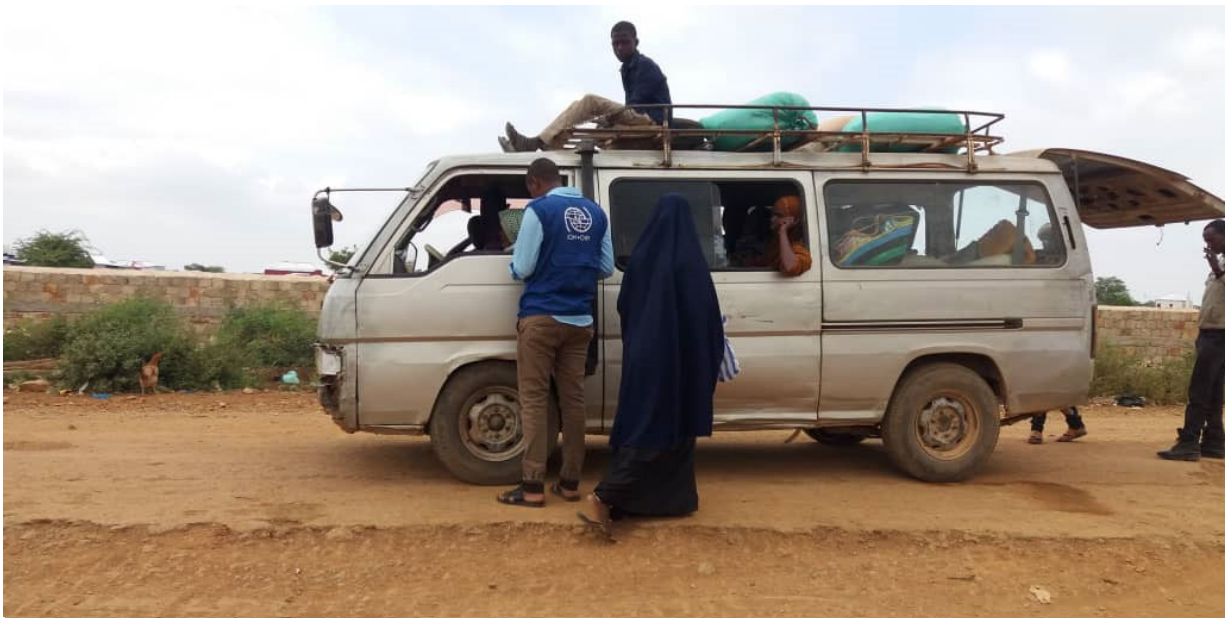
IOM MTT enumerators identifying IDPs exiting from IDP sites and conducting interviews with the heads of household. © Hassan Aden, IOM Somalia 2018

MTT aims to complement existing information management products on displacements and movements in Baidoa, by providing site level specific data on population movements on a regular basis, to assist agencies operating in sites and settlements with key information on: demographics of movement, area of origin, area of return/onward movement, reasons for movement and movement trends over time.