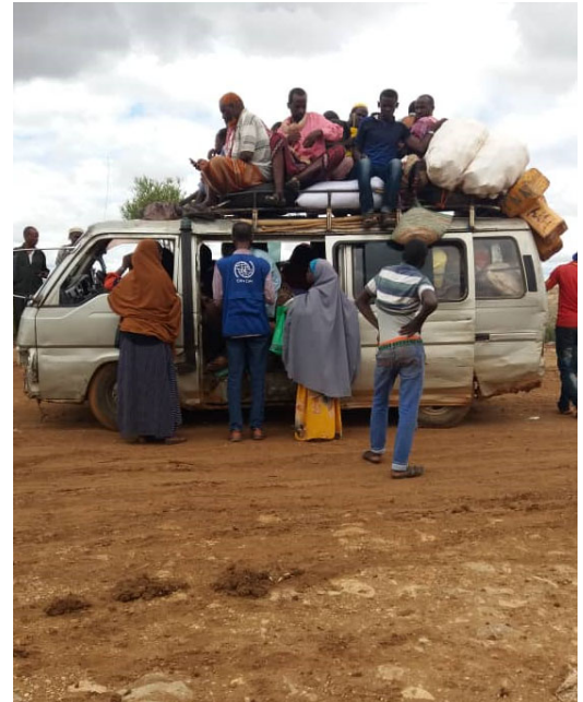
Figure 1: MTT enumerator interviews in Baidoa last week.