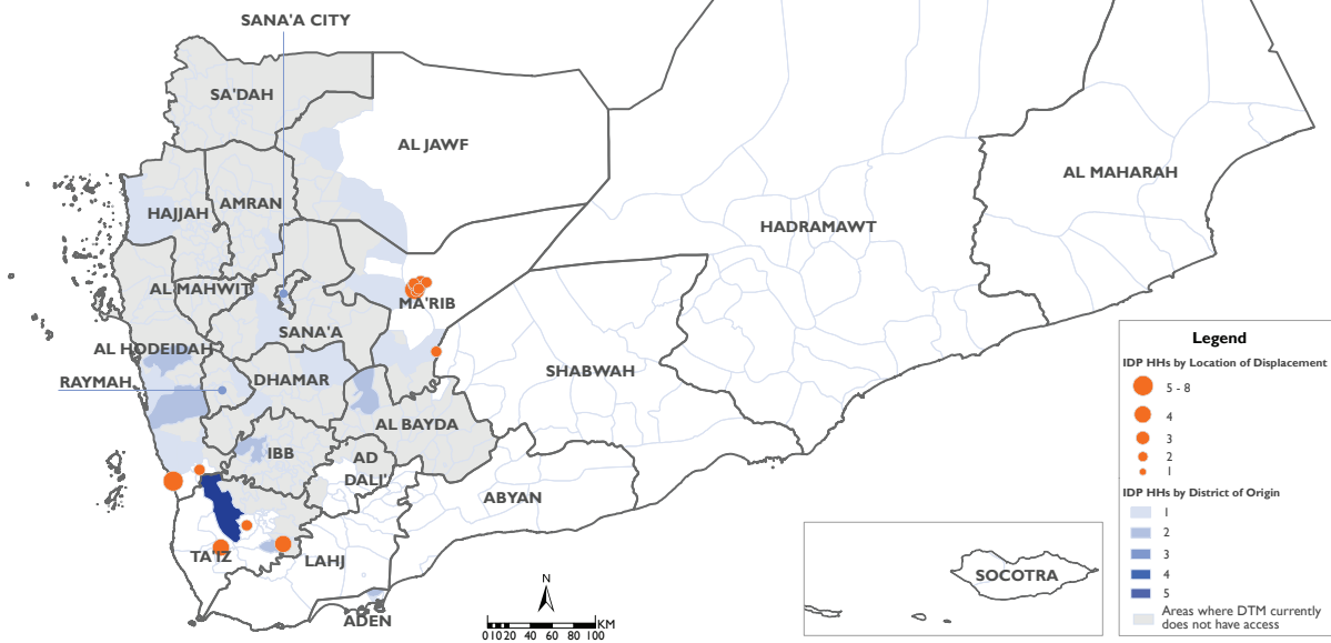
Disclaimer: This map is for illustration purposes only. Names and boundaries on this map do not imply official endorsement or acceptance by IOM.