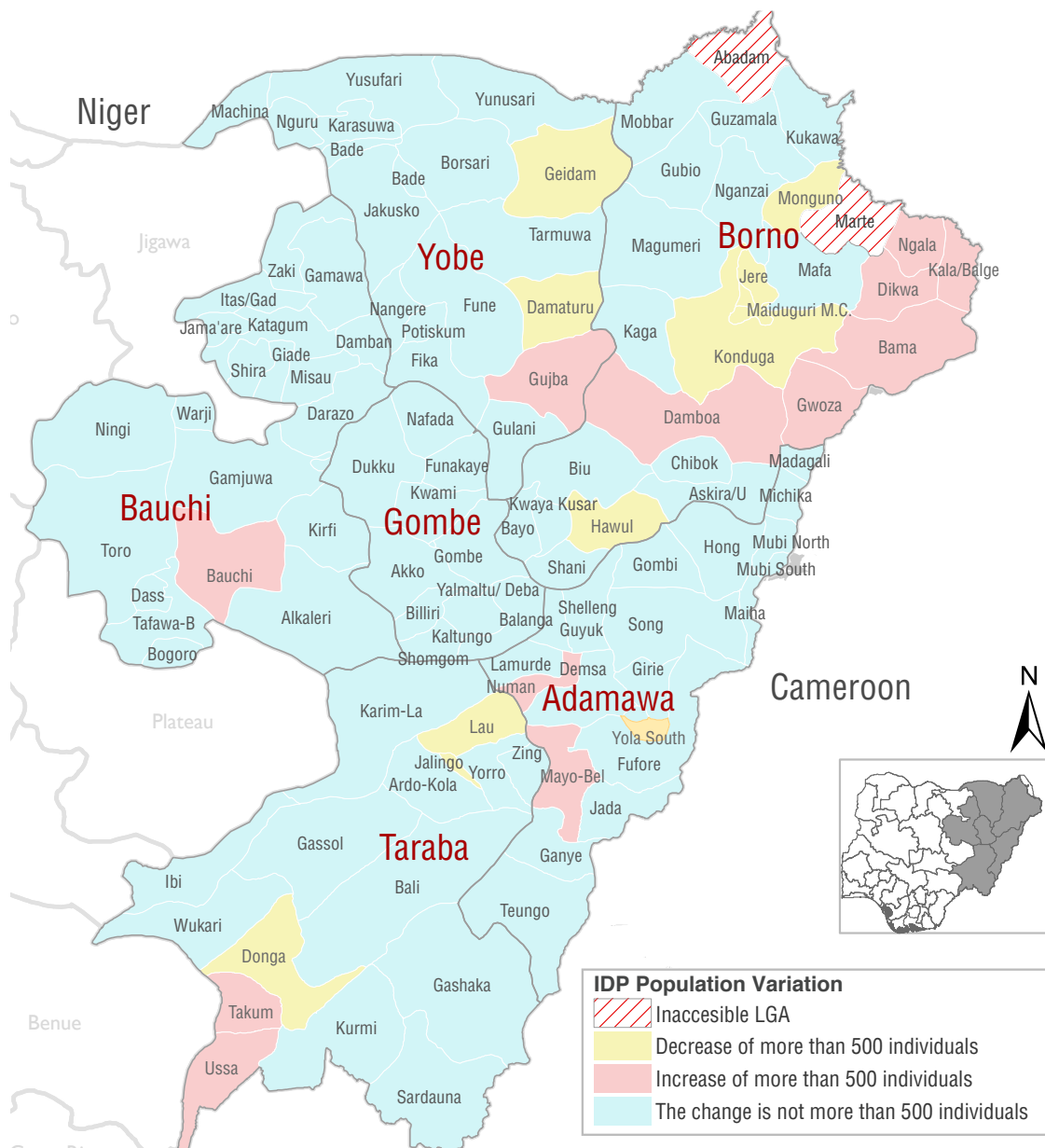
IDP Population Variation Inaccessible LGA Decrease of more than 500 individuals Increase of more than 500 individuals The change is not more than 500 individuals

LGAs with IDPs population increase; total increase between R 23 and 24 is +41,696