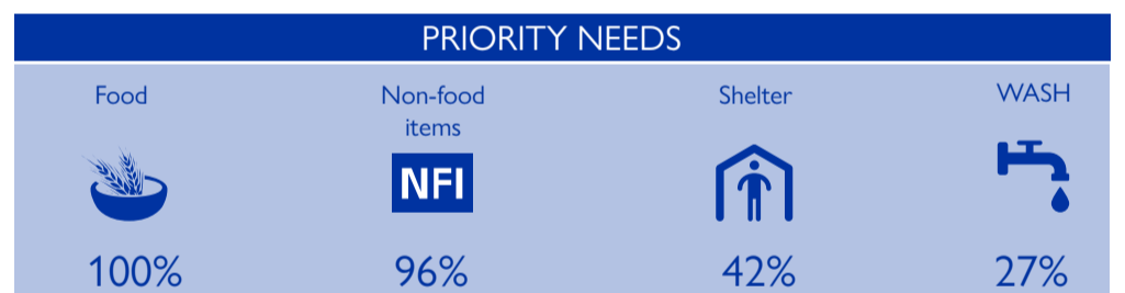
Fig. 2: Most needed assistance [Multiple response]

The maps are for illustration purposes only. The boundaries and names shown and the designations used on this map do not imply official endorsement or acceptance by International Organization for Migration.