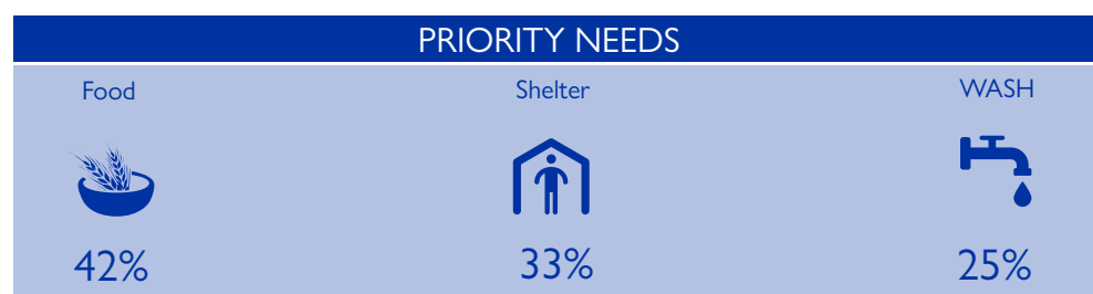
Fig. 2: Most needed assistance