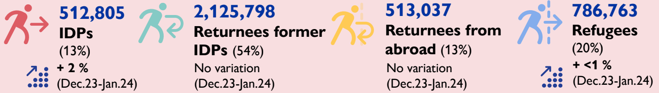
Number of returnees former IDPs, per year