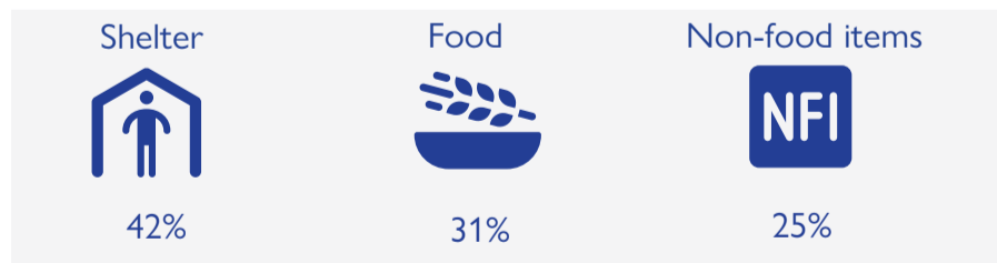
Fig. 2 Priority needs

This map is for illustration purposes only. The boundaries and names shown, and the designations used on this map do not imply official endorsement or acceptance by the International Organization for Migration.