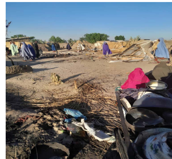
Pictures showing damaged shelters during and after the fire outbreak

On 22 January 2024, fires broke out in Flutari, Gana Ali, and Water Board camps in Monguno Local Government Area (LGA) of Borno State, which destroyed the shelters and possessions of many Internally Displaced Persons (IDPs). Many personal items were lost in the fire, including food ration cards and biometric identification cards. There were no reported injuries or fatalities.