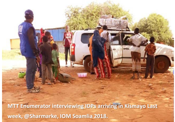
MTT Enumerator interviewing IDPs arriving in Kismayo Last week