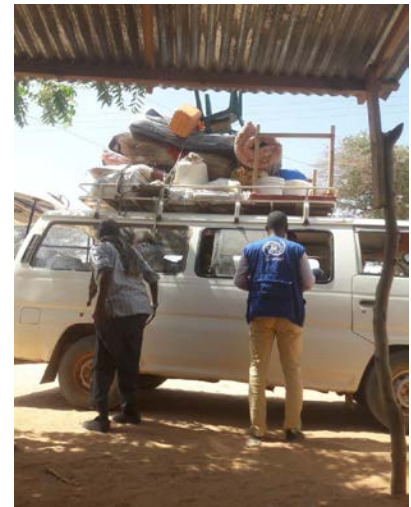
INTERVIEWING IDPs arriving