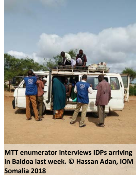
MTT enumerator interviews IDPs arriving in Baidoa last week.