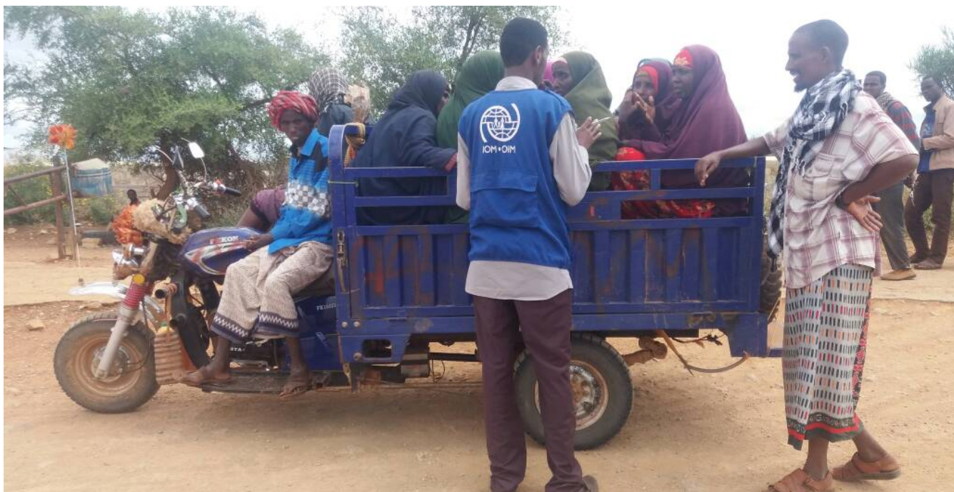
IOM MTT enumerators identifying IDPs exiting from IDP sites and conducting interviews with the heads of household.