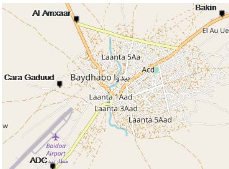
MTT checkpoints around Baidoa town

MTT aims to complement existing information management products on displacements and movements in Baidoa, by providing site level specific data on population movements on a regular basis, to assist agencies operating in sites and settlements with key information on: demographics of movement, area of origin, area of return/onward movement, reasons for movement and movement trends over time.