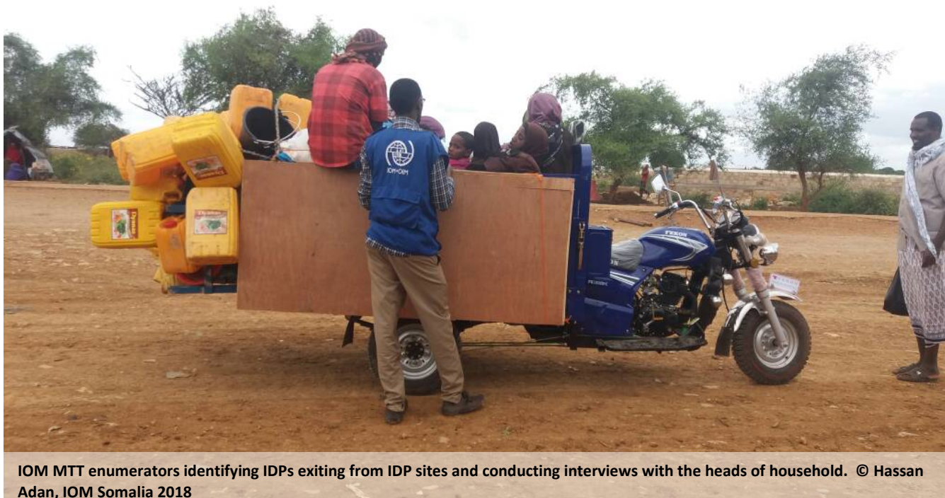
IOM MTT enumerators identifying IDPs exiting from IDP sites and conducting interviews with the heads of household.