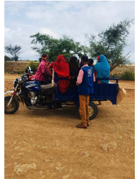
MTT enumerator interviews IDPs arriving in Baidoa last week.