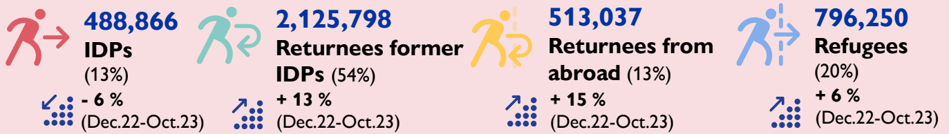
Number of returnees former IDPs, per year