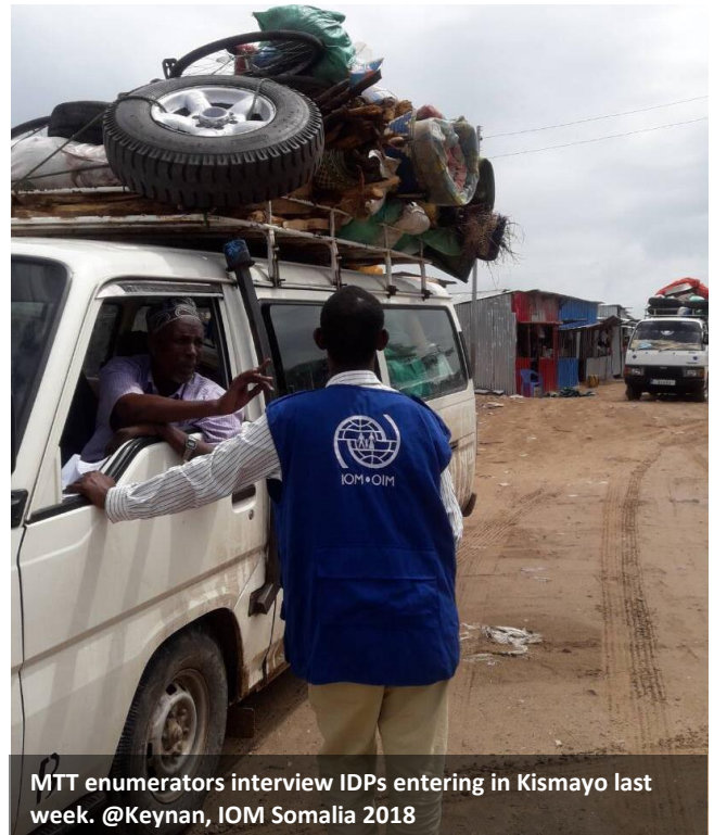
MTT enumerators interview IDPs entering in Kismayo last week.