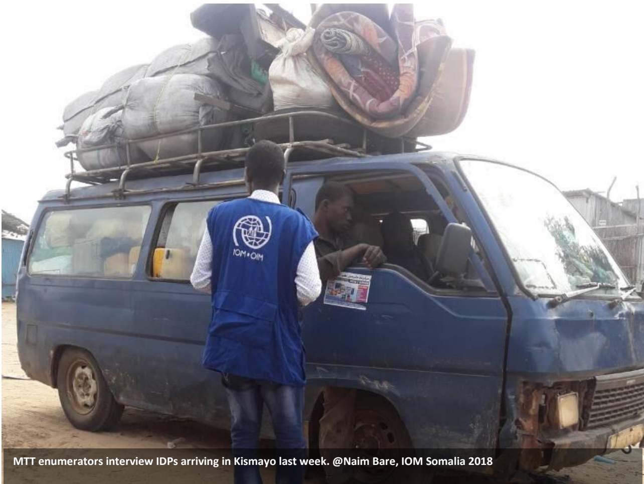
MTT enumerators interview IDPs arriving in Kismayo last week.