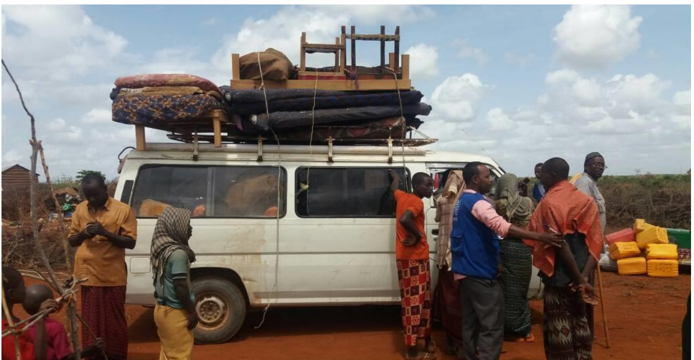
IOM MTT enumerators identify IDPs exiting from the IDP sites and conduct interviews with the heads of household.