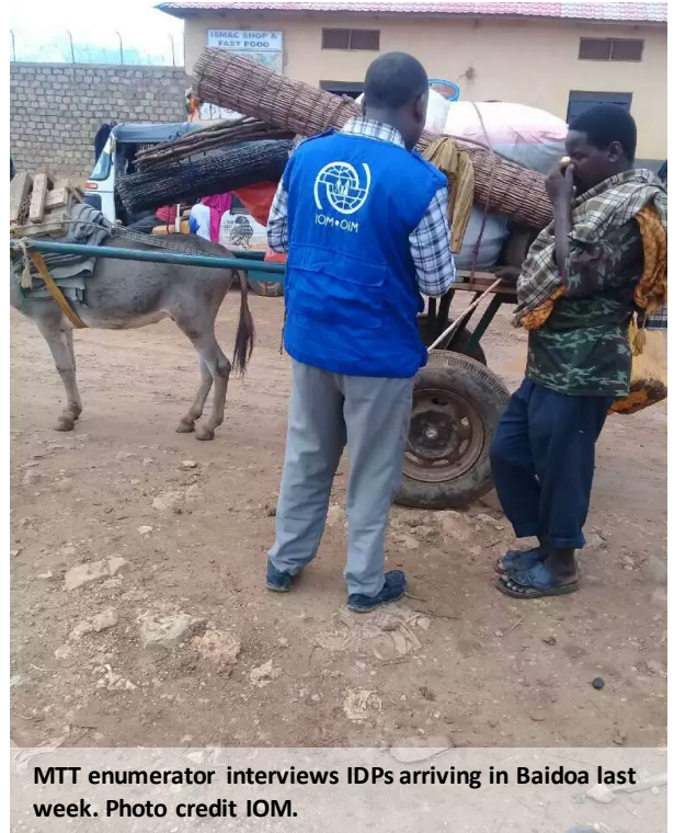
MTT enumerator interviews IDPs arriving in Baidoa last week.