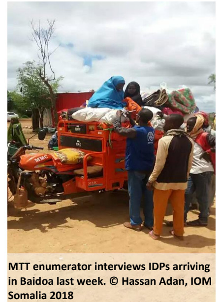
MTT enumerator interviews IDPs arriving in Baidoa last week.