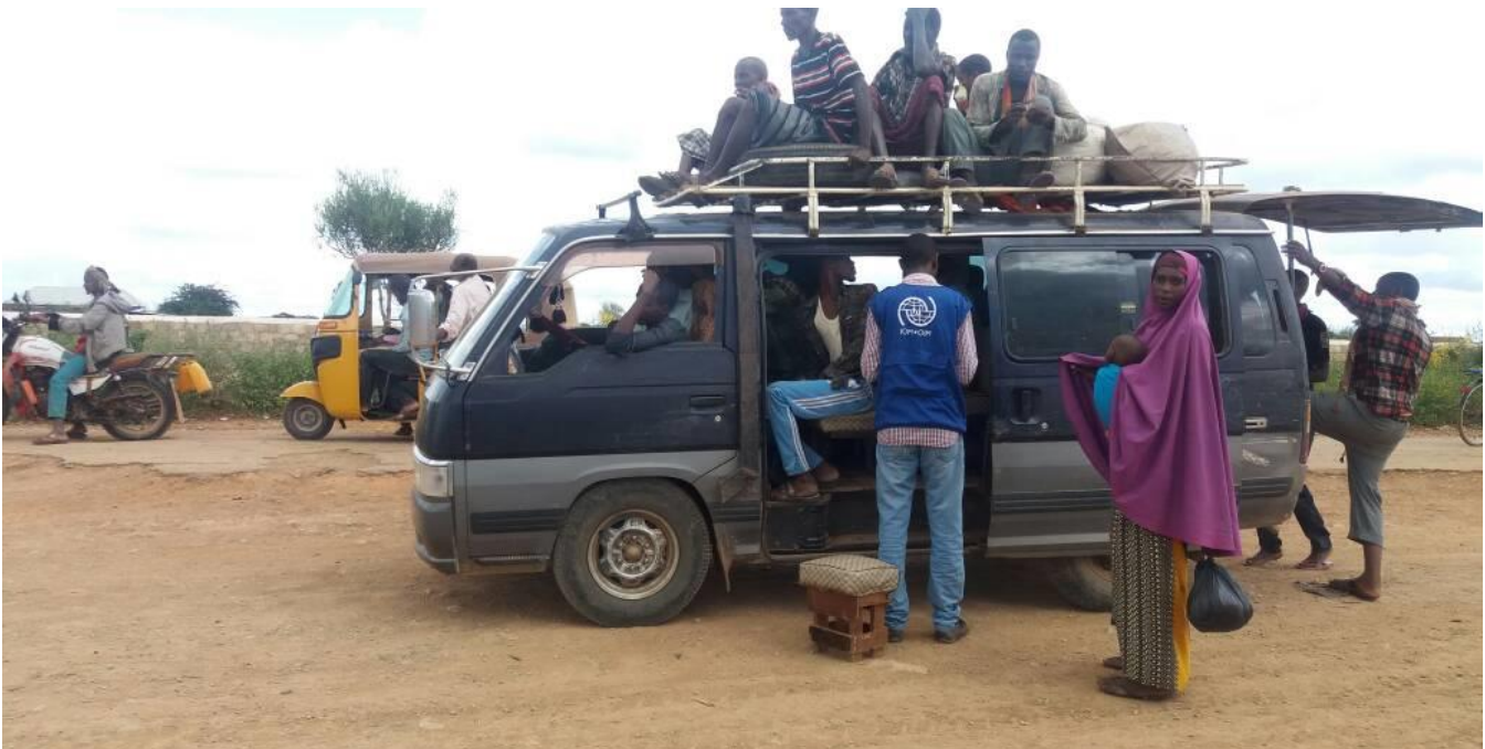
IOM MTT enumerators identifying IDPs exiting from IDP sites and conducting interviews with the heads of household.