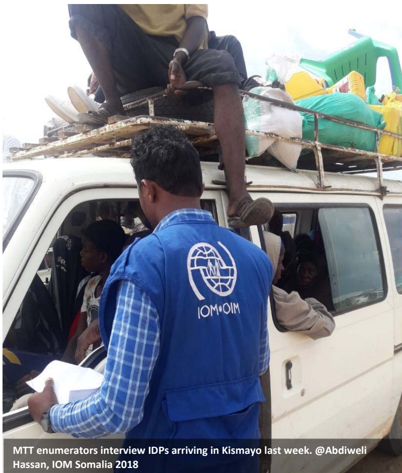
MTT enumerators interview IDPs arriving in Kismayo last week.

MTT aims to complement existing information management products on displacements and movements in Kismayo, by providing site level specific data on population movements on a regular basis, to assist agencies operating in sites and settlements with key information on: demographics of movement, area of origin, area of return/onward movement, reasons for movement and movement trends over time.