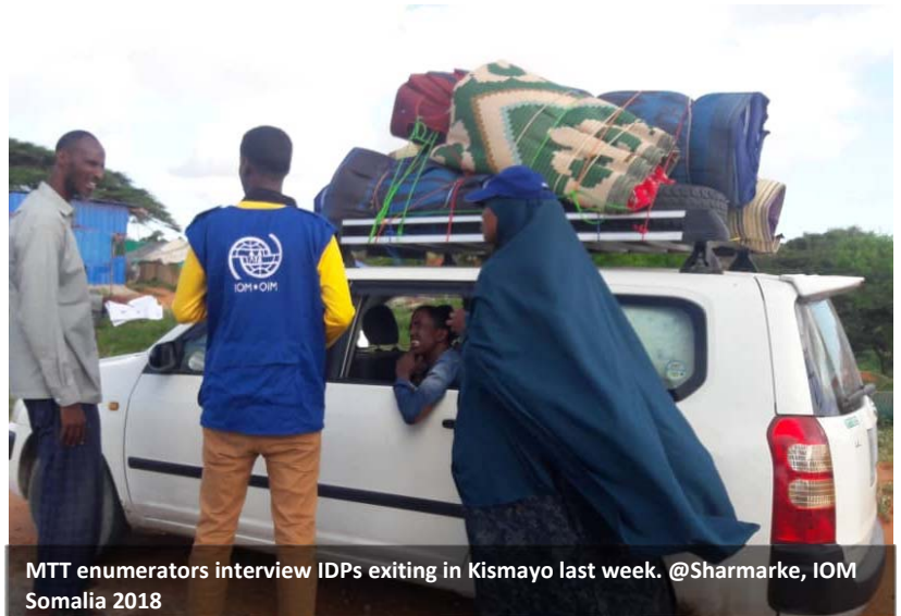
MTT enumerators interview IDPs exiting in Kismayo last week. @Sharmarke, IOM Somalia 2018