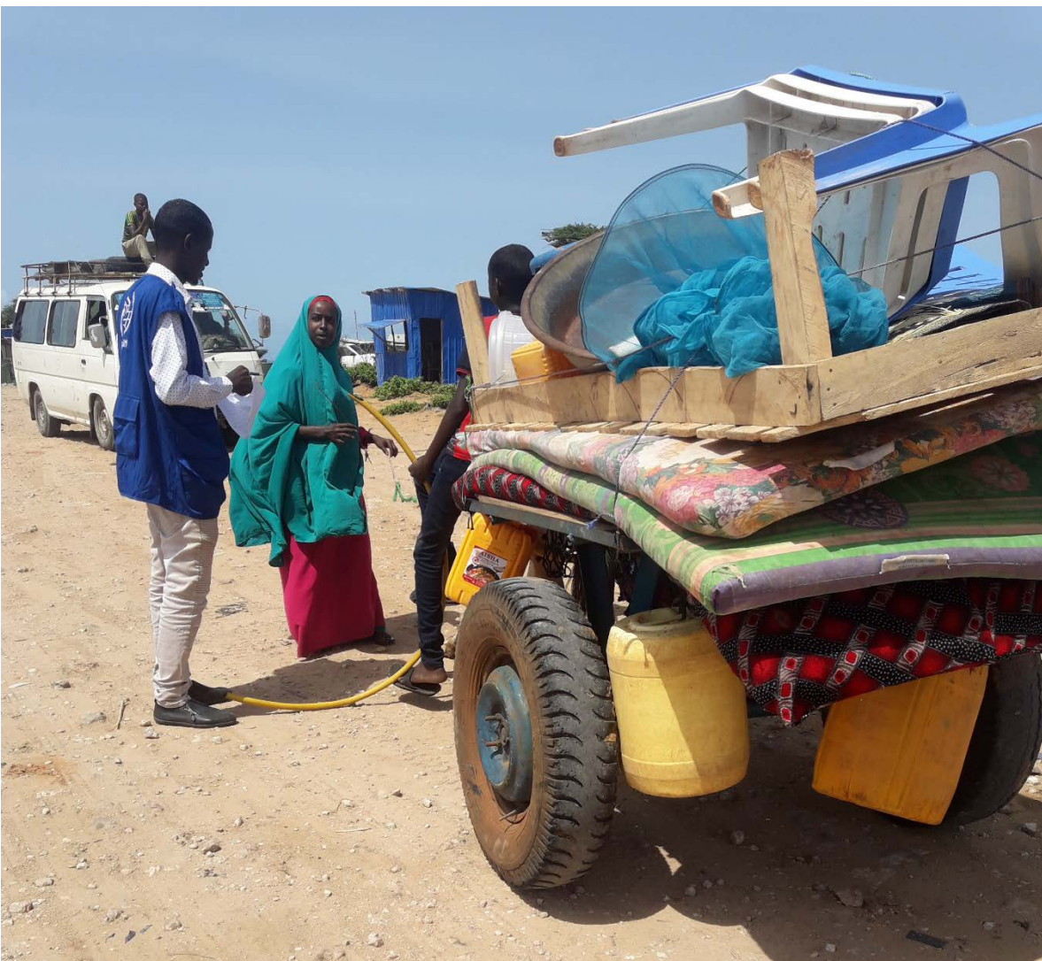
MTT enumerators interview IDPs arriving in Kismayo last week.

MTT aims to complement existing information management products on displacements and movements in Kismayo, by providing site level specific data on population movements on a regular basis, to assist agencies operating in sites and settlements with key information on: demographics of movement, area of origin, area of return/onward movement, reasons for movement and movement trends over time.