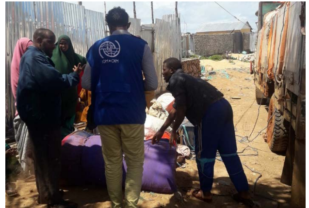
MTT enumerators interview IDPs arriving in Kismayo last week.