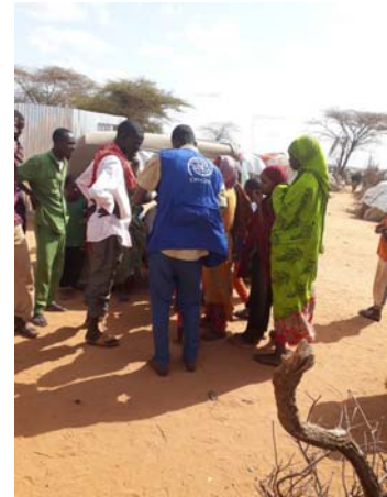
Figure 1MTT enumerator interviewing IDPs exiting