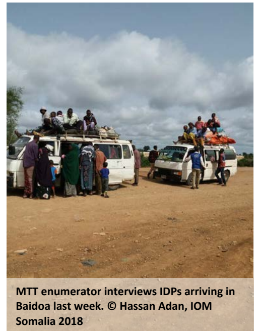
MTT enumerator interviews IDPs arriving in Baidoa last week.