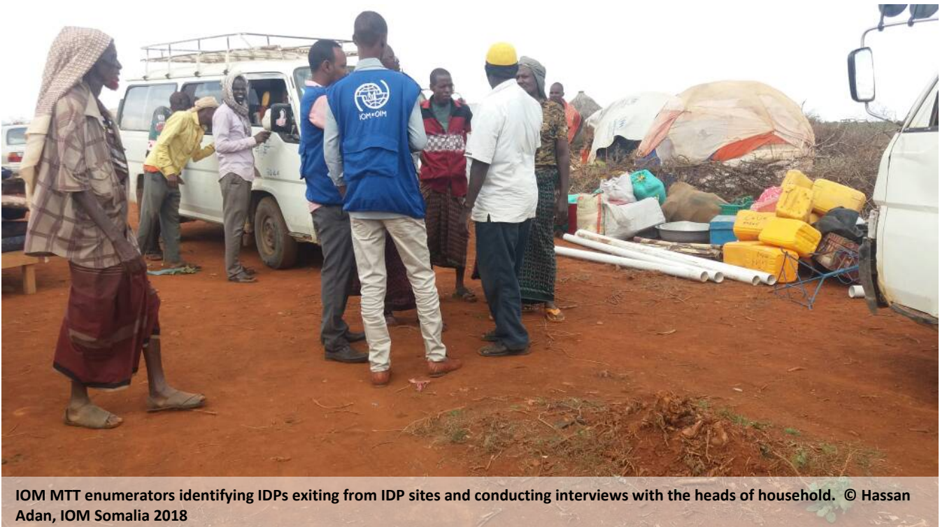
IOM MTT enumerators identifying IDPs exiting from IDP sites and conducting interviews with the heads of household.