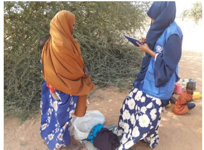
Figure 1: MTT ENUMURATOR INTERVIEWING