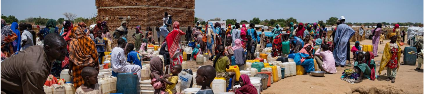
Displaced persons from Sudan queue to collect water in Adre.