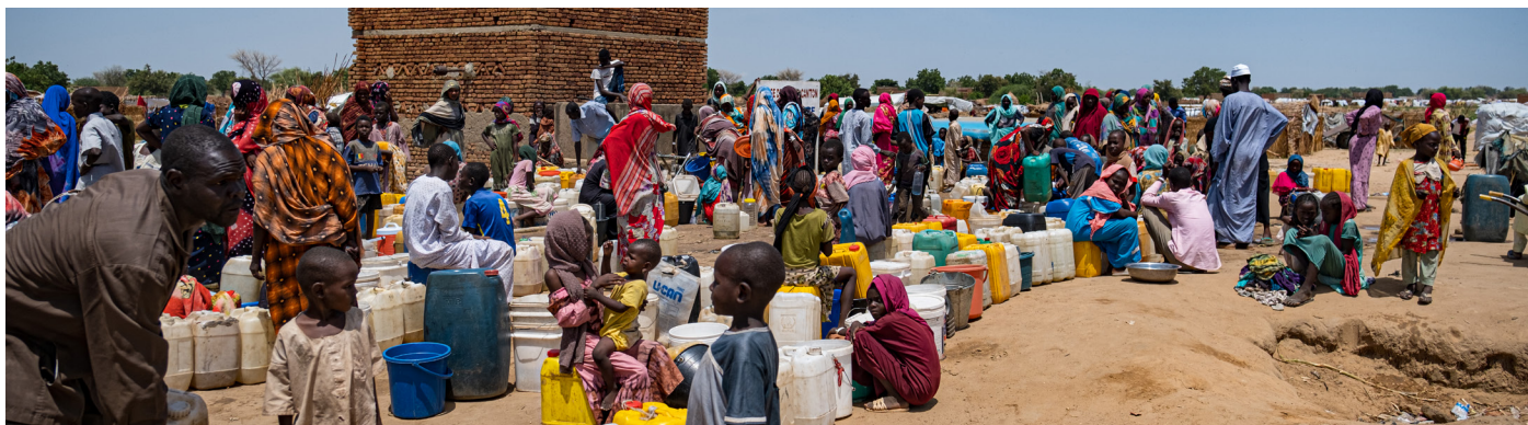
Displaced persons from Sudan queue to collect water in Adre. Photo: IOM/ François-Xavier Ada 2023.