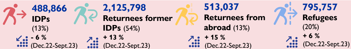
Number of returnees former IDPs, per year