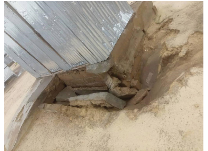
Shelters affected by heavy rainfall in Ngala LGA