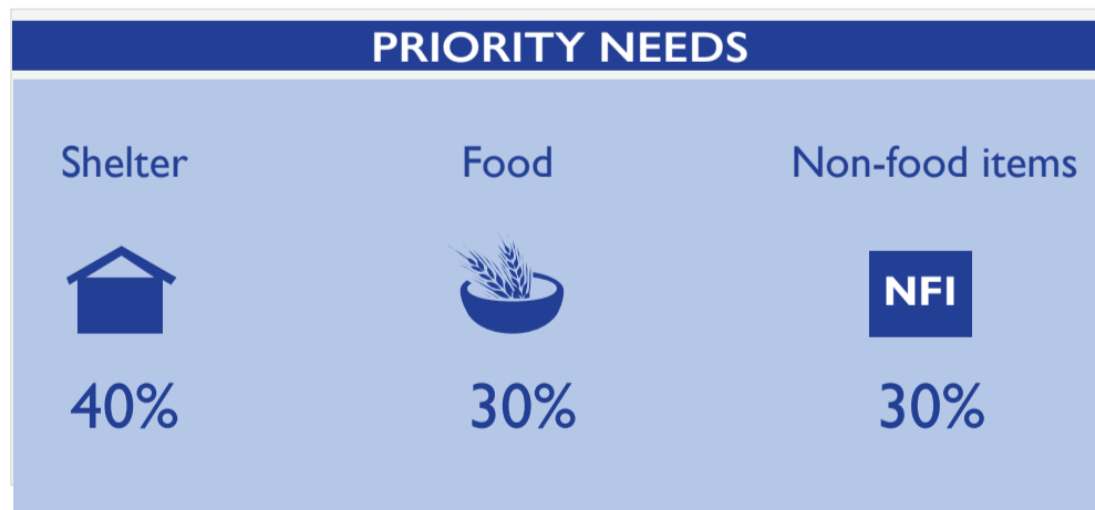
Fig 1. Priority needs