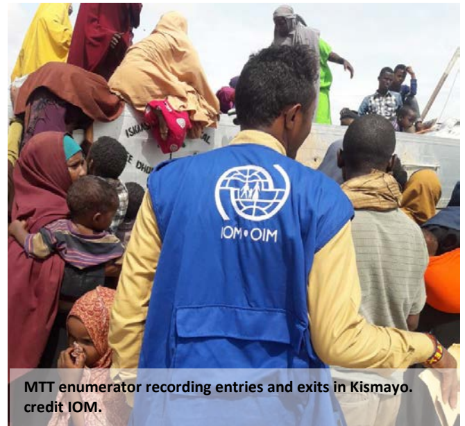
MTT enumerator recording entries and exits in Kismayo.