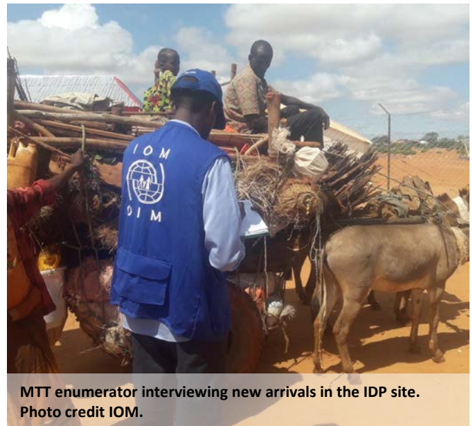
MTT enumerator interviewing new arrivals in the IDP site.