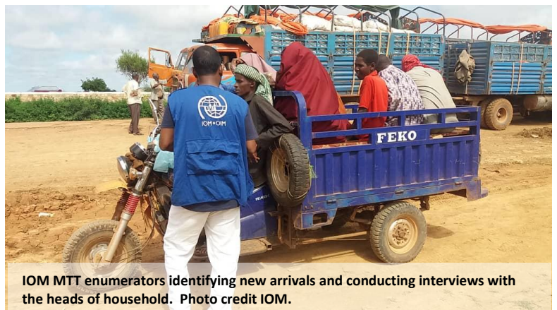
IOM MTT enumerators identifying new arrivals and conducting interviews with the heads of household.