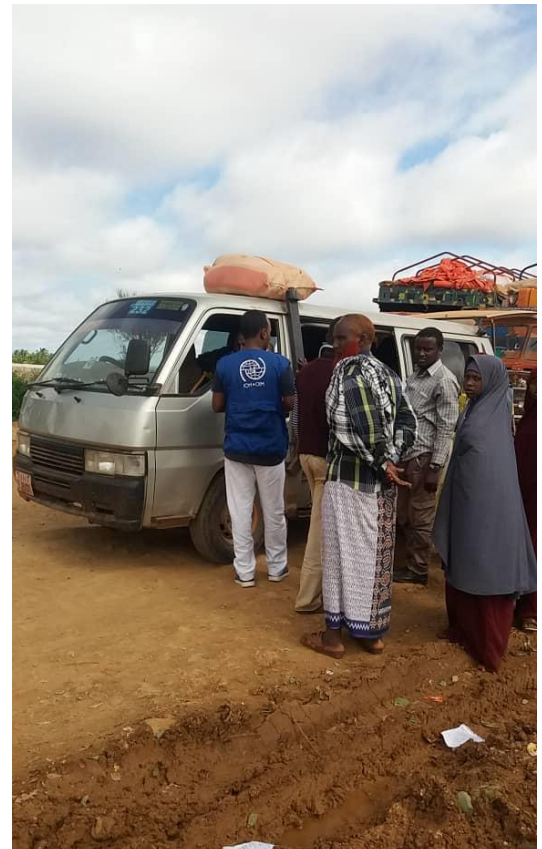
MTT enumerator interviews IDPs arriving in Baidoa.