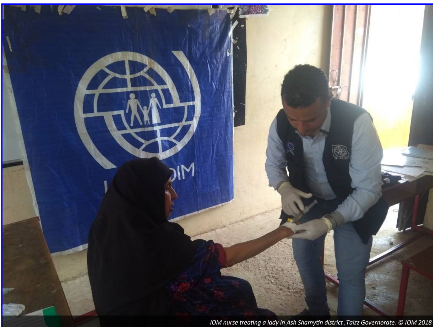
IOM nurse treating a lady in Ash Shamytin district, Taizz Governorate.

Focused psychosocial support services (PSS) was provided to 253 children and their parents – including 99 girls, 139 boys, 14 women, and 1 man – through individual and group sessions conducted in Child Friendly Spaces (CFSs).