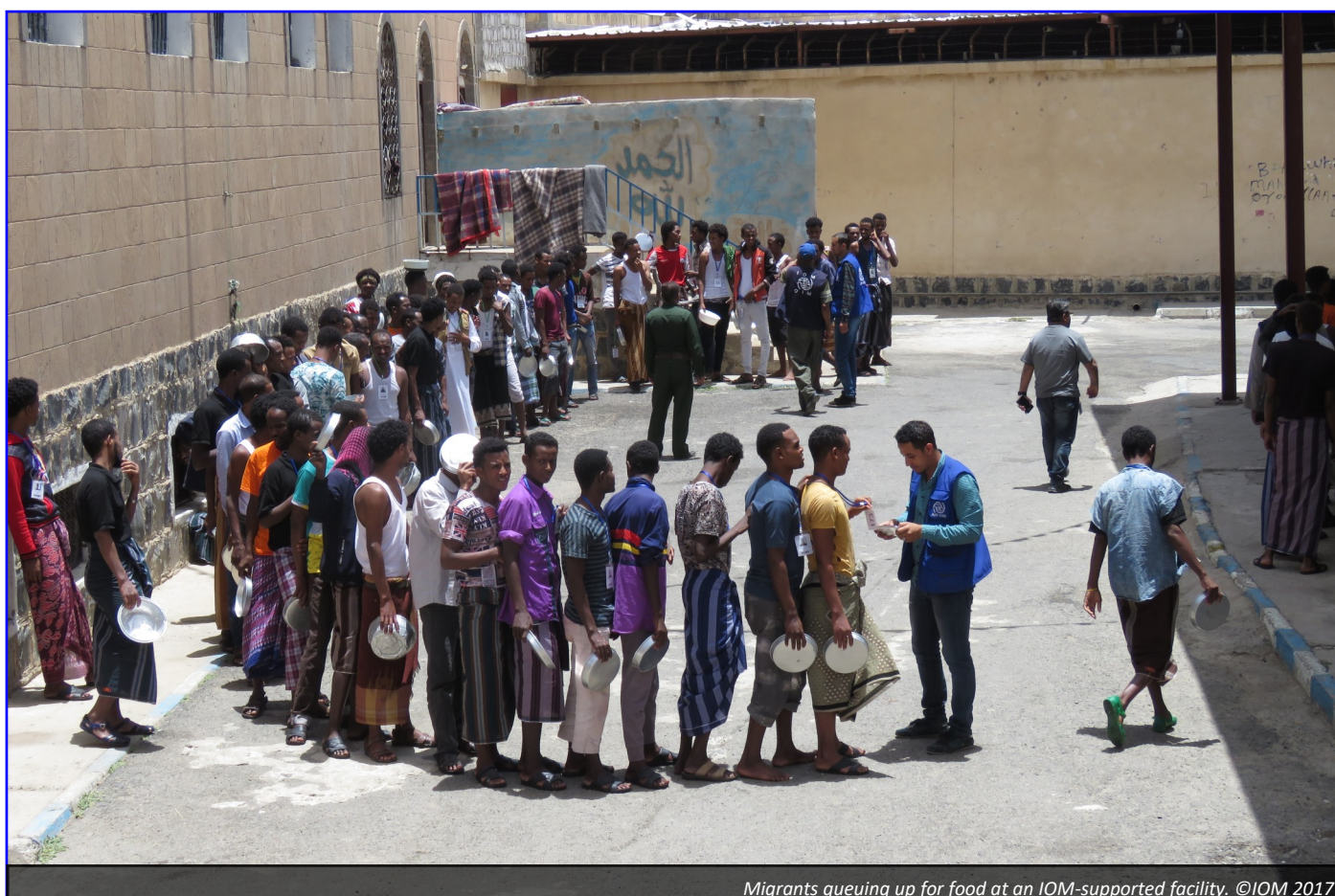
Migrants queuing up for food at an IOM-supported facility.