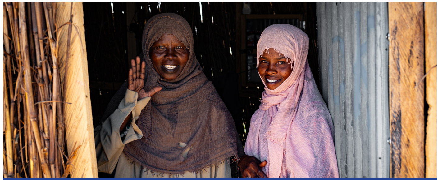
A mother and a daughter living in the Tongori site stand in from of their shelter provided by IOM.