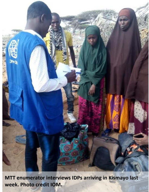
MTT enumerator interviews IDPs arriving in Kismayo last week. Photo credit IOM.