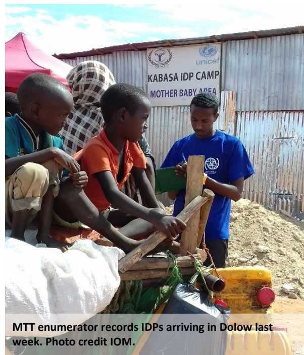
MTT enumerator records IDPs arriving in Dolow last week.