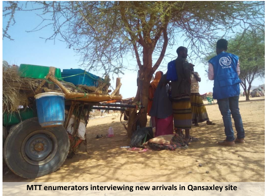
MTT enumerators interviewing new arrivals in Qansaxley site