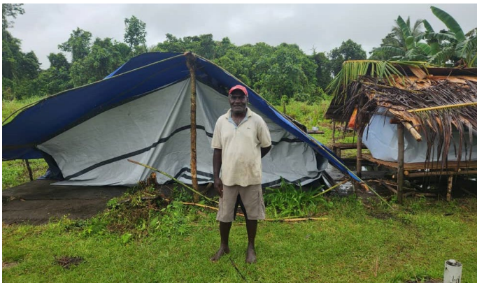
Photo: Shelter remains a critical concern for several IDP households. © IOM 2023/Mohamud OMER

IDPs at the Piva site have been offered the option to relocate to Soroken village. However, there is a lack of enthusiasm among the displaced population. This reluctance is due to uncertainties regarding the absence of essential services in that area, including shelter and WASH among others.