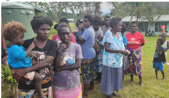
Photo: Internally displaced persons living at Piva station care centre.

Six per cent of the total IDP population assessed were found to be particularly vulnerable individuals including breastfeeding mothers (83), single female heads of household (34), people living with disabilities (32), pregnant women (24), unaccompanied elderly persons (12), persons with chronic illness or medical conditions (9), and child headed household (1). Reports from Wakunai and Torokina indicate that there are children separated from their parents or guardians who are being cared for by close relatives at the care centres (total figure unknown).