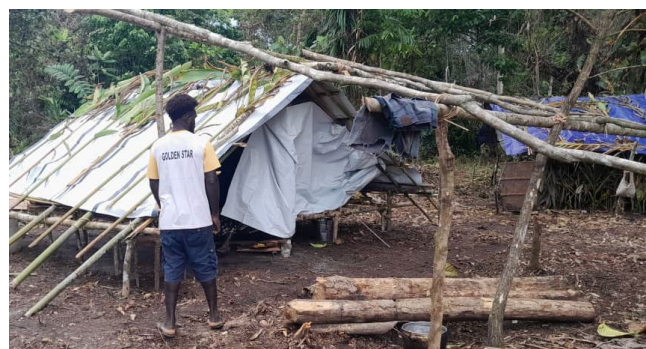
Photo: Makeshift shelters at Piva station care centre.

In the care centers, makeshift shelters are also insufficient for protecting against weather-related dangers, particularly heavy rainfall. This concern is compounded by the recurring worry among residents regarding the continuous rain, which could lead to flooding. Other households, especially those at Wakunai, are living in traditional and semi-permanent shelters belonging to the host families.