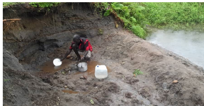
Photo: The affected population has resorted to collect drinking water from unsafe sources. © IOM 2023/Quintin TALINGAPUA

All currently used water sources are prone to contamination, lacking proper protection and at risk of exposure to potential contaminants from volcanic ash and flooding. At the Wakunai care centre, there are also no proper water catchment areas, putting it at higher risk when it comes to ensuring access to water. There are around four rivers to which the communities have access to, yet these are all off-site, requiring an average walk of one hour round trip to access. To assess the safety of these water sources, samples have been collected by the International Organization for Migration (IOM) and sent to Port Moresby for comprehensive laboratory testing and analysis. Water testing of nearby water sources, and coordination with WASH Cluster co-leads and the relevant government partners is ongoing.