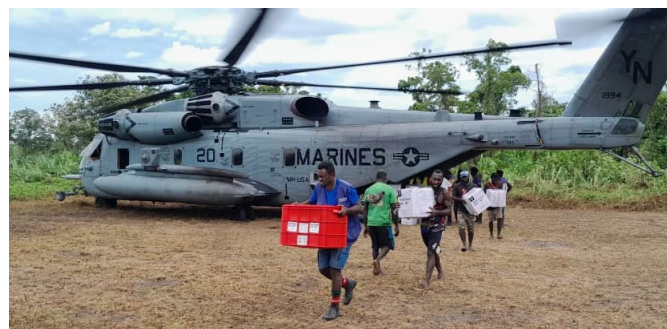
Photo: IOM, US Department of Defense and ABG delivering relief supplies at Piva station care centre.

With generous financial support from the United States Agency for International Development Bureau for Humanitarian Assistance (USAID/BHA), IOM distributed 127 water containers and 4 water tanks to improve water access and storage at care centres. IOM has a pipeline of shelter and NFIs and is targeting 724 IDP HHs with this assistance.