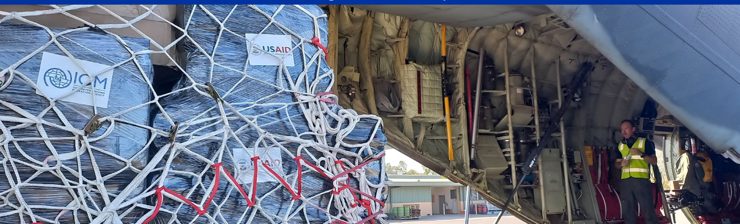
Photo: Australian Defense Forces' C-130 aircraft loading relief supplies at the Jacksons International Airport in Port Moresby.