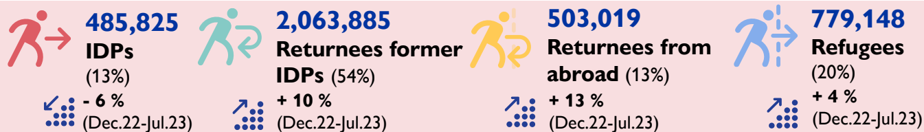
Number of returnees former IDPs, per year