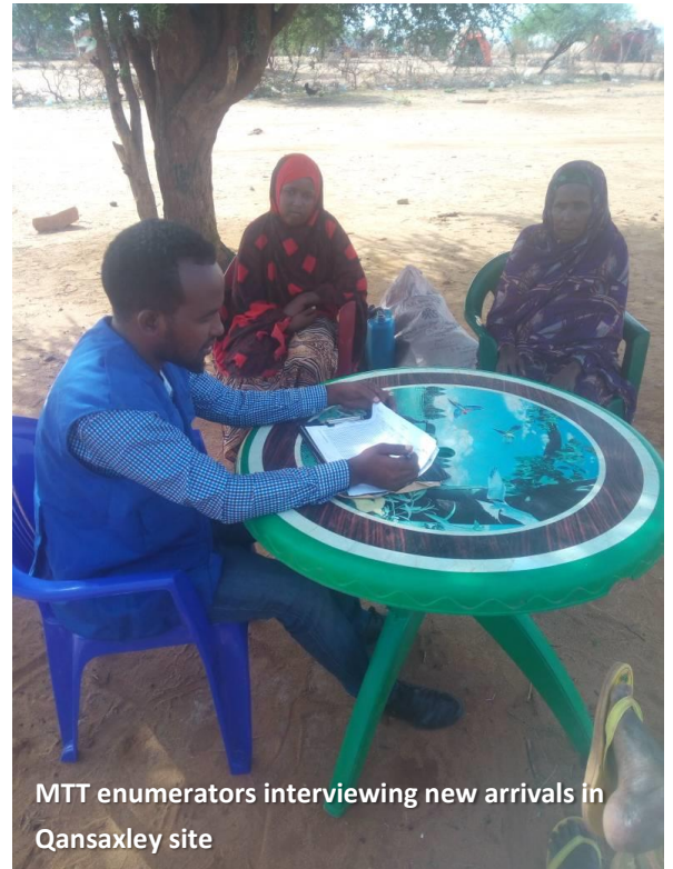
MTT enumerators interviewing new arrivals in Qansaxley site