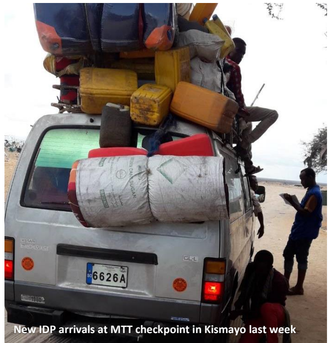
New IDP arrivals at MTT checkpoint in Kismayo last week