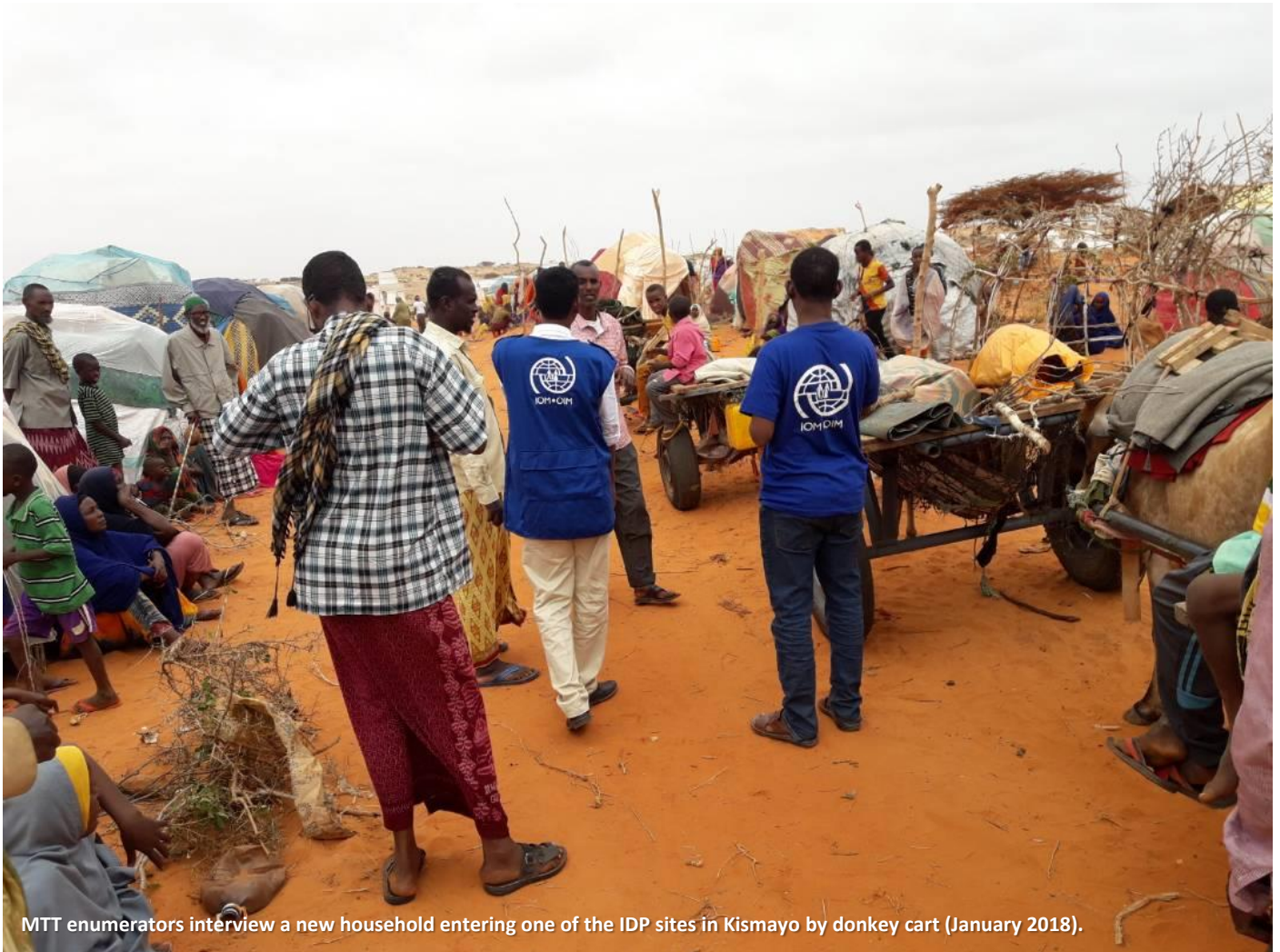
MTT enumerators interview a new household entering one of the IDP sites in Kismayo by donkey cart (January 2018).

MTT aims to complement existing information management products on displacements and movements in Kismayo, by providing site level specific data on population movements on a regular basis, to assist agencies operating in sites and settlements with key information on: demographics of movement, area of origin, area of return/onward movement, reasons for movement and movement trends over time.