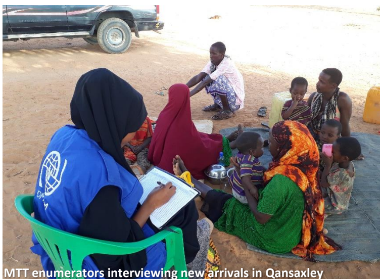
MTT enumerators interviewing new arrivals in Qansaxley