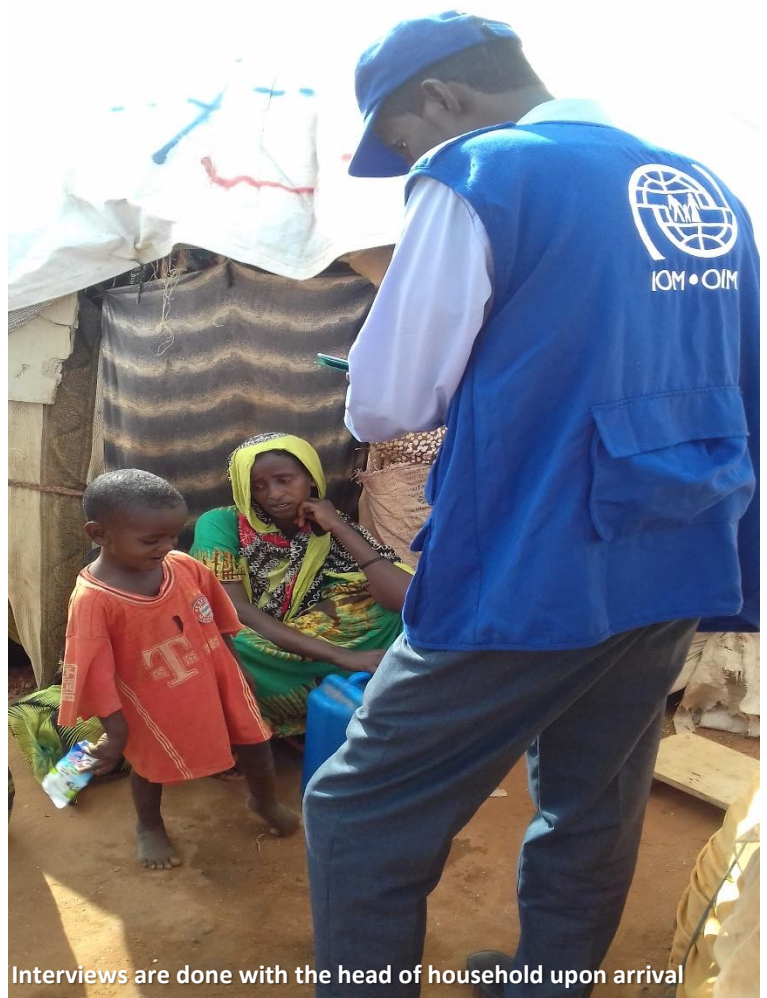
Interviews are done with the head of household upon arrival

MTT aims to complement existing information management products on displacements and movements in Dolow, by providing site level specific data on population movements on a regular basis, to assist agencies operating in sites and settlements with key information on: demographics of movement, area of origin, area of return/onward movement, reasons for movement and movement trends over time.