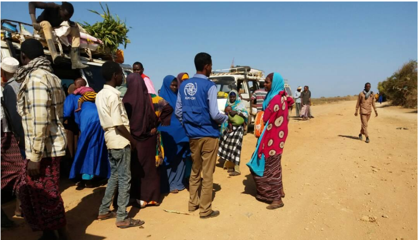
IOM MTT enumerators identify new arrivals passing through the Baidoa checkpoints with luggage, and conduct interviews with the heads of household.

MTT aims to complement existing information management products on displacements and movements in Baidoa, by providing site level specific data on population movements on a regular basis, to assist agencies operating in sites and settlements with key information on: demographics of movement, area of origin, area of return/onward movement, reasons for movement and movement trends over time.