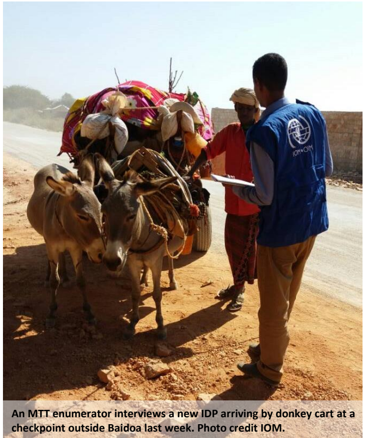
An MTT enumerator interviews a new IDP arriving by donkey cart at a checkpoint outside Baidoa last week.