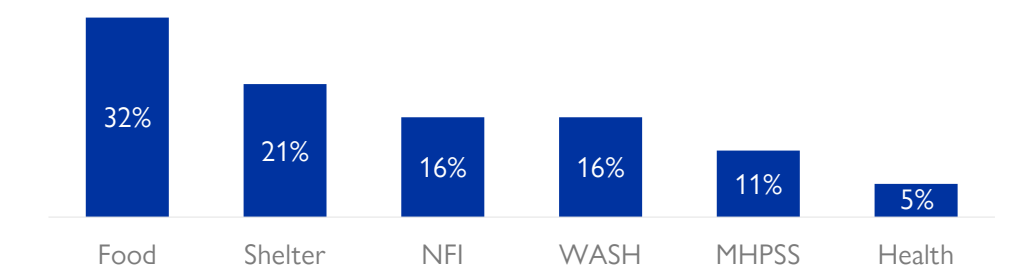
Fig. 2. Most needed assistance