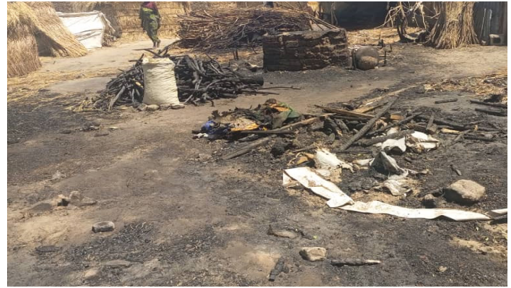
Aftermath of the fire outbreak at Shuwari camp Dikwa LGA.

On March 9 and 11, several fire outbreaks were reported in the camps of Shuwari, Masarmari, and 1000 in Dikwa LGA in Borno State. The fire outbreak affected a total of 237 individuals and destroyed 41 shelters. The affected individuals include 118 children, 84 women, and 35 men. The majority of those affected by the fire outbreaks lost their personal items in the fire, including food allotment cards and biometric cards. The fire outbreak was caused by the wind spreading cooking fires. No injuries or deaths were reported.